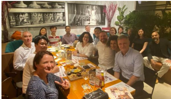
Singapore, 3 March 2023

As part of Birkbeck’s 200 th Anniversary celebrations, the Development and Alumni team “took to the road” to meet members of our alumni community in several global cities. Pictures from some recent gatherings can be seen below: