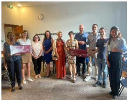
Paris, 8 June 2023