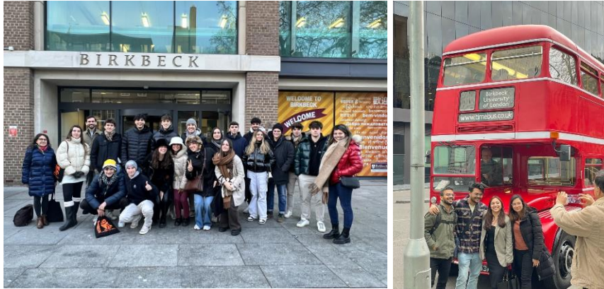
Visiting students from UIC Barcelona