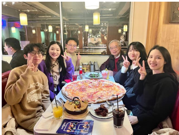
Outing for students from SWUFE, China