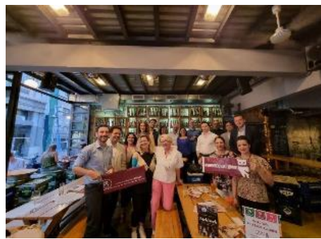
Athens, 8 June 2023