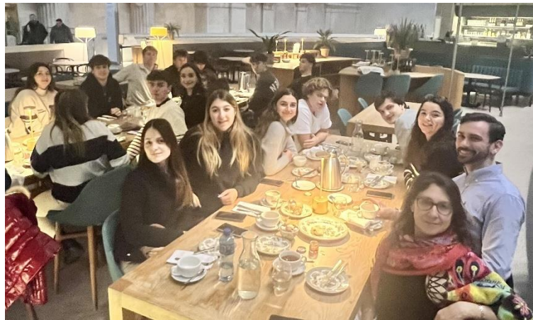
Afternoon tea in the British Museum