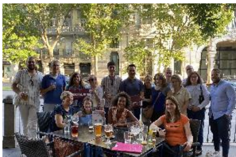
Madrid, 15 June 2023