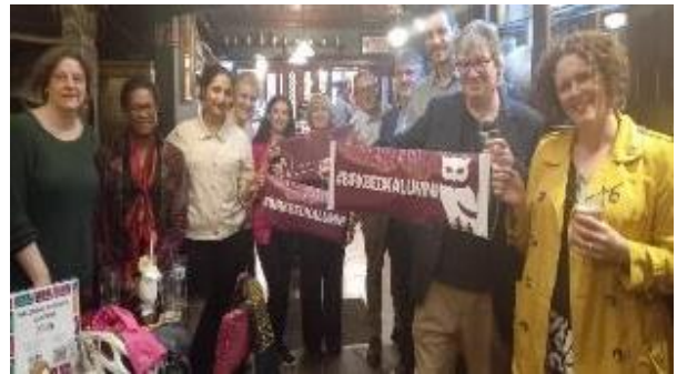
Dublin, 18 May 2023