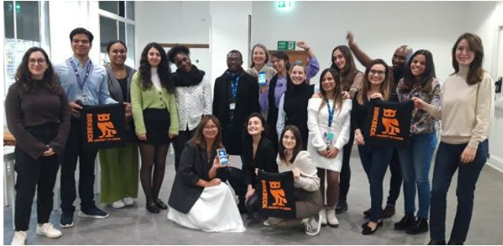
Chevening scholars on 2 December 2022

Among the 2022-23 cohort of international students were recipients of the prestigious Chevening Scholarships selected based on their leadership potential and academic profile. These Chevening scholars, funded by the Foreign, Commonwealth and Development Office and partner organisations, similarly reflected diverse nationalities, backgrounds, and life experiences.