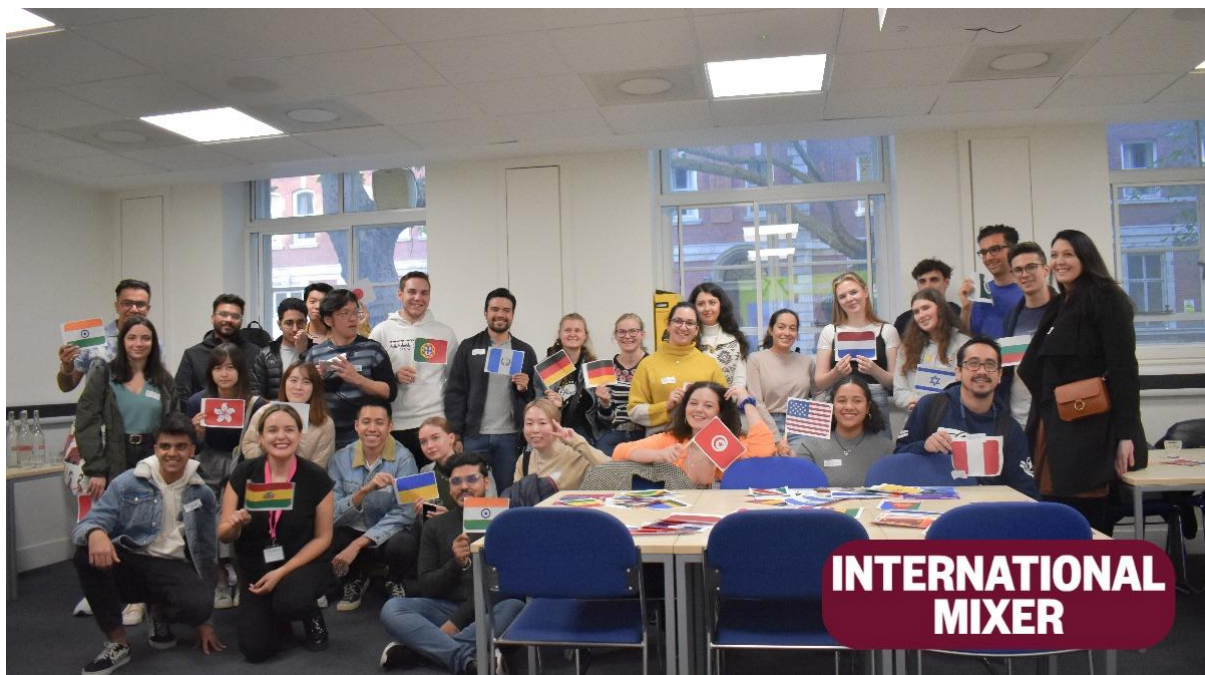
Celebrating the International Student Day 2022

Pictures from some of the foregoing events can be seen below: