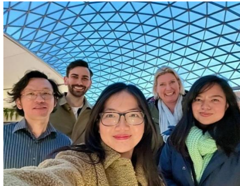
Visiting the British Museum