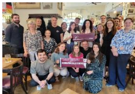
Berlin, 15 June 2023